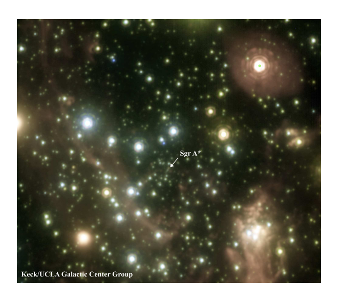
Figure 1: A composite near-infrared (HKL') image of the central 10'' \times 10'' (0.4 pc × 0.4 pc) of our Galaxy obtained with the laser guide star adaptive optics system at the W. M. Keck telescope. With this and similar set-ups, it has been possible to demonstrate the existence of a supermassive black hole, to detect the infrared emission associated with the black hole, and begin to study the paradoxical young stars in this region. However, even at this resolution (fwhm \sim 60 mas), source confusion is the dominant source of positional uncertainty.

The Milky Way has therefore become a laboratory for learning by example about SMBHs and their environs at the centers of other galaxies. With both existing and upcoming facilities, the next decade of high angular resolution infrared observations offers a promising new era of discovery in Galactic center research.