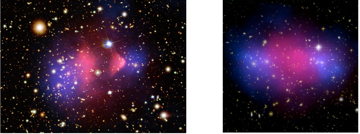
Figure 1: The color composite of the Bullet cluster 1E0657–56 (left) and MACS J0025.4–1222 (right). Overlaid in blue shade is the surface mass density map from the weak lensing mass reconstruction. The X-ray emitting plasma is shown in red . Both images subtend \sim 10 arcmin on the vertical axis. Credit (left): X-ray NASA/CXC/CfA Optical: NASA/STScI; Magellan/U.Arizona; Clowe et al. (2006); Bradač et al. (2006) (right) X-ray (NASA/CXC/Stanford/S.Allen); Optical/Lensing (NASA/STScI/UCSB/M.Bradač); Bradač et al. (2008b).